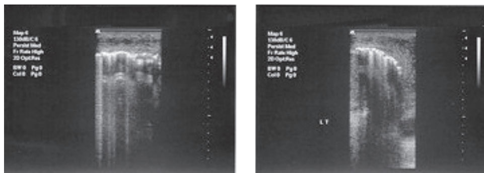
Figure 1 – Ultrasound showed great scrotal tunicae thickening stratification and gas within the scrotal wall.

A 30-years-old obese man (BMI = 56 kg/m 2 ) was admitted to emergency department with fever (38.7 °C), pain, erythema and swelling extended from the left scrotum to the left lower abdominal quadrant. The symptoms started within 24 hours. He did not refer any trauma, endoscopic handling or any other predisposing factors related to Fournier's gangrene, such as diabetes mellitus. During physical examination body temperature was 38.7 °C, respiratory frequency was 35 b/min, heart rate was 120 beats/min, arterial pressure was 80/50 mm Hg (mean arterial pressure 60 mm Hg) and the patient was confused with low urinary excretion. Physical examination of the left scrotum and the abdomen revealed sensitivity, redness and swelling. Digital rectum examination was normal. Moreover, a massive, painless and motionless mass in the left breast was revealed. Laboratory findings showed polynucleosis (WBC: 21.2 K/ \mu l), creatinine: 3.9 mg/dl, CRP: