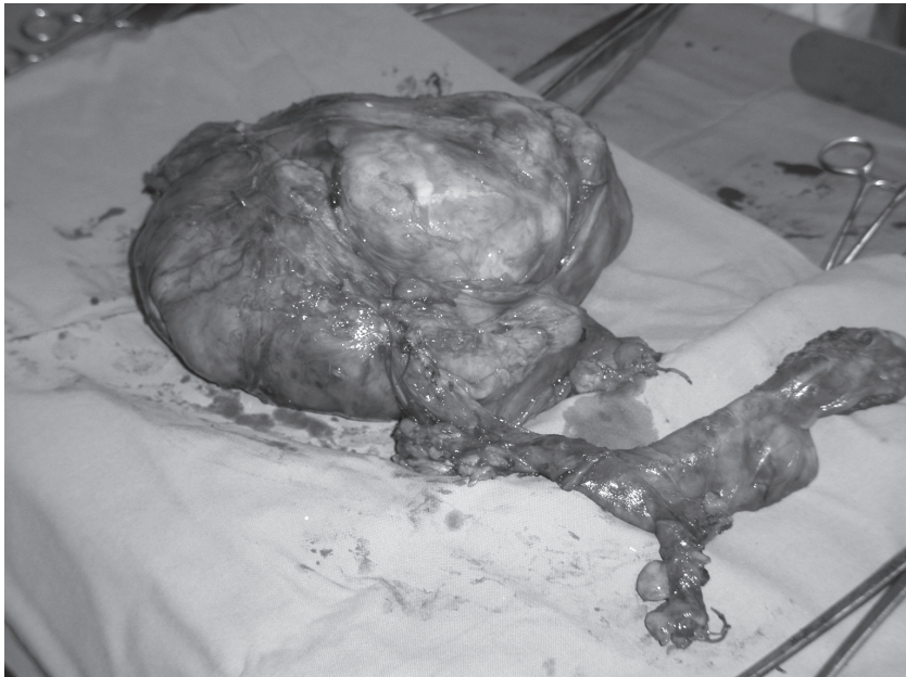
Figure 3 – The second part of the excised tumor.